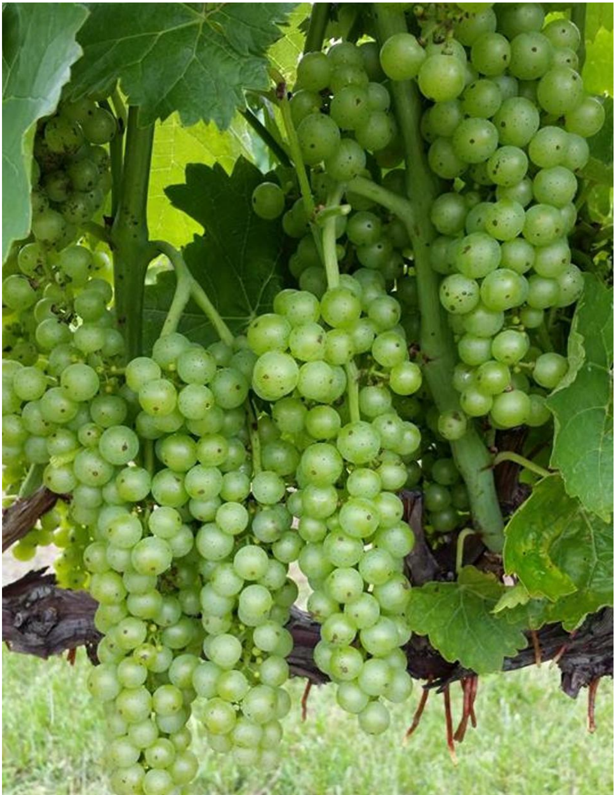
Rockside Winery and Vineyards grow all the grapes on site. ROCKSIDE WINERY AND VINEYARDS

Rockside Winery and Vineyards , Lancaster, specializes in estate wines, growing all the grapes and bottling right on site. Try their Steuben rosé to get a full taste of that Ohio flavor in this spacious setting. Rockside Winery and Vineyards is located just minutes from Columbus. The first vines were